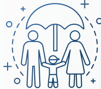
Industry - Insurance

Modernized tooling with an open ALM platform, simplifying developer tasks and improving efficiency.