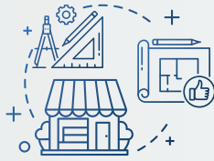
Industry - Construction