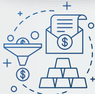
Industry - Banking

Achieved seamless SCM transition, reduced migration timelines, and eliminated costly licenses through automation and DevOps Adoption.